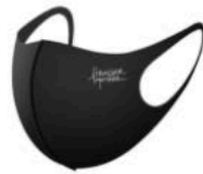
Face Cover - Black from $4.95 SALE

Washable face covers that provide comfort and protection.