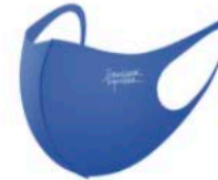
Face Cover - Blue from $4.95 SALE