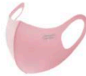
Face Cover - Pink from $4.95 SALE